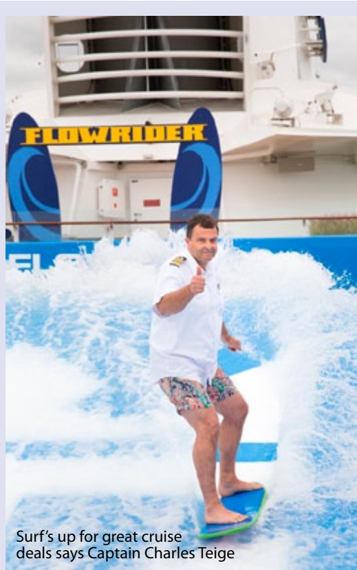
Surf's up for great cruise deals says Captain Charles Teige

Fares start from $1339 per person quad share for the first two guests, with third and fourth guests from just $39 each per day on Voyager of the Seas' 13-night South Pacific & Fiji Cruise, departing Sydney on 6 April, 2017. The cruise calls at Noumea and Isle of Pines in New Caledonia, and continues to Lautoka and Suva in Fiji and Mystery Island in Vanuatu before returning to Sydney. www.royalcaribbean.co.nz