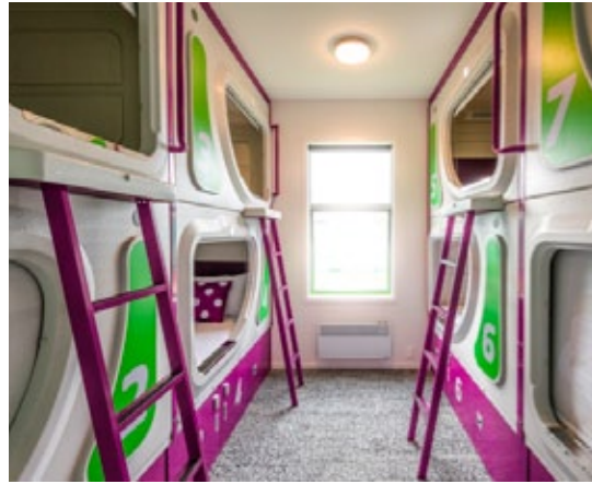
Pod life at JUCY Snooze

Alpe says the concept has been well received, and around 600 international bookings were secured a month before