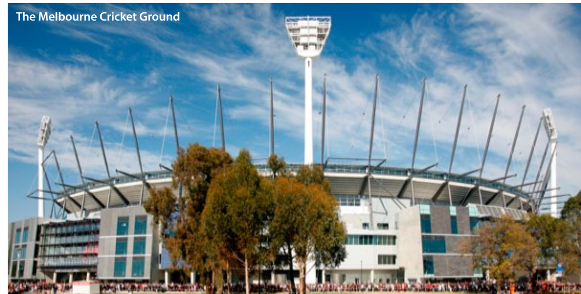
The Melbourne Cricket Ground

It will be hosted at and with Melbourne arts venues and companies including the Arts Centre Melbourne.