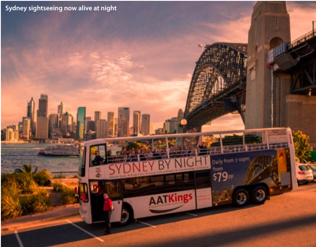
Sydney sightseeing now alive at night