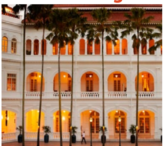
No guest feathers will be ruffled when Raffles is refurbished

The historic Raffles Singapore will be undergoing extensive renovations from early 2017.