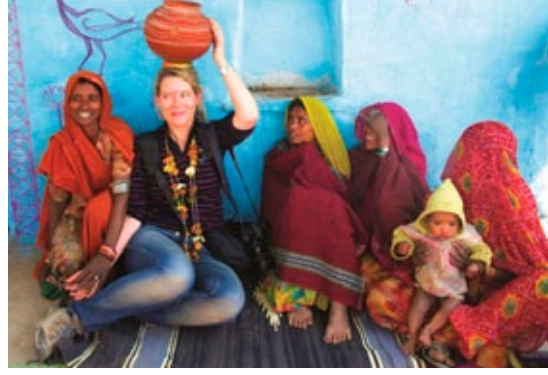
Uniworld is aiming to help families in Rajasthan

The five-day experience starts from US$2375 per person and includes all accommodation, meals and drinks (including wine and beer), a range of sightseeing activities, internal flights, group transportation and a professional facilitator.