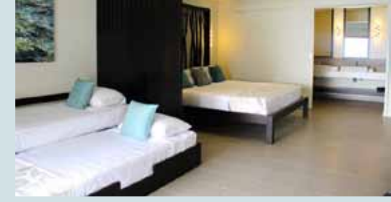
A look into the new Premium Beachfront Bure at Treasure Island

The 12 bures will be 25% larger in floor size than the existing bures on the island and designed to accommodate two adults, three children under twelve years of age and an infant but can also host four adults.