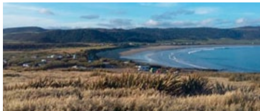
Being predator free will pay dividends for New Zealand's tourism industry, campaigners say