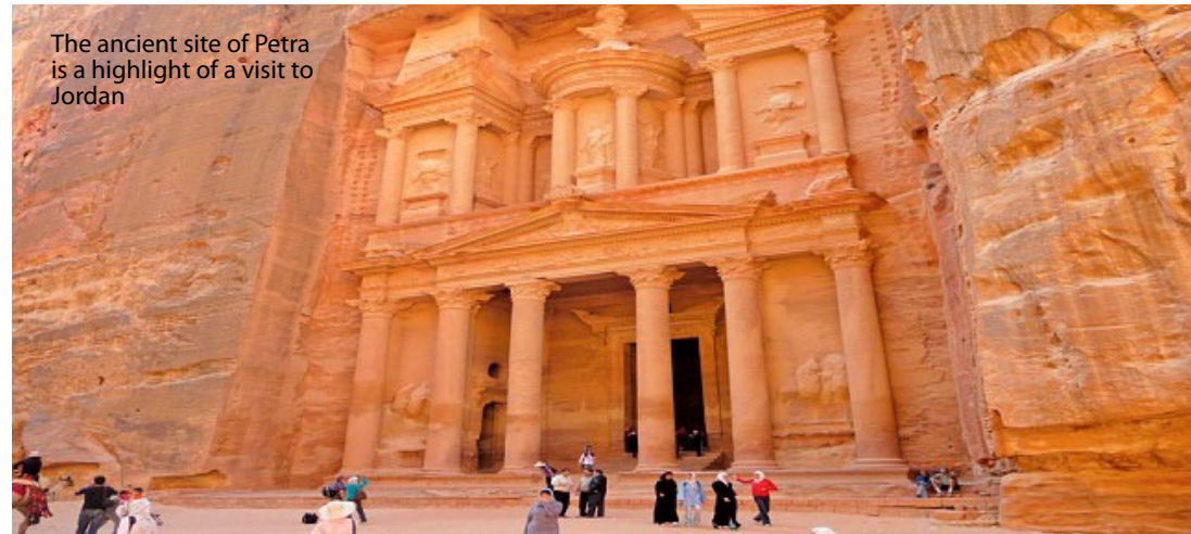
The ancient site of Petra is a highlight of a visit to Jordan

http://www.exoticholidays.co.nz/destination/packages/Iran/32