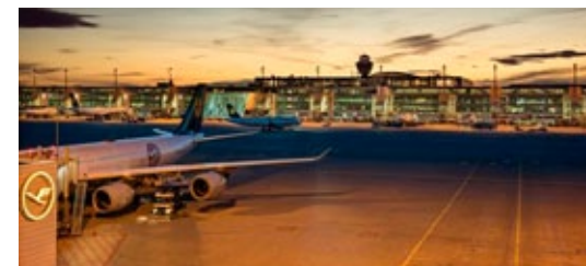
Munich Airport and Lufthansa won the best airport terminal

or work. The décor was also widely praised, with many details inspired by local sights and culture. Terminal 2 is jointly operated by Munich Airport and Lufthansa as a 60/40 partnership.