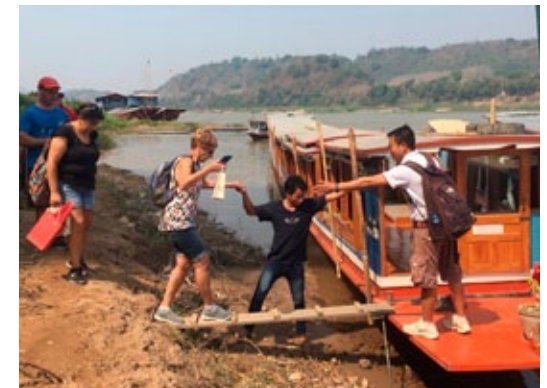
The Mekong adventure begins