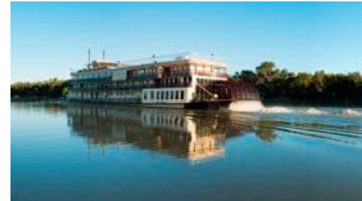
All aboard for an early Christmas

leaves on 7, 14 and 21 July. The early-bird fares start from A$803 per person, twin share. And the four-night trip departs on 10, 17 and 24 July, with an earlybird price of A$1099 per person, twin share. Meanwhile, the seven-night cruise combines the three and four night trips. Fares start from A$1639 per person twin share.