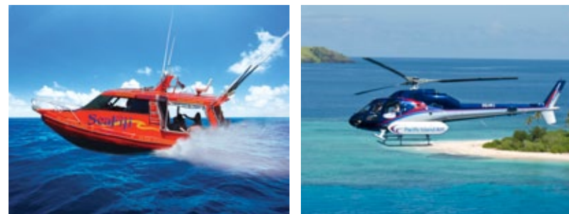
SeaFiji and Pacific Island Air have just launched a new transfer package in Fiji

She says although the official launch will be at the Fiji Tourism Expo in May, 'Fly n Float' is now on the market.