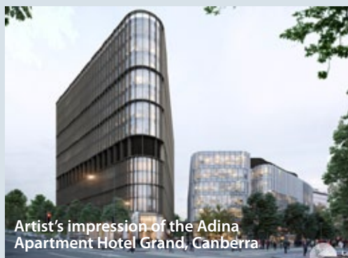
Artist's impression of the Adina Apartment Hotel Grand, Canberra