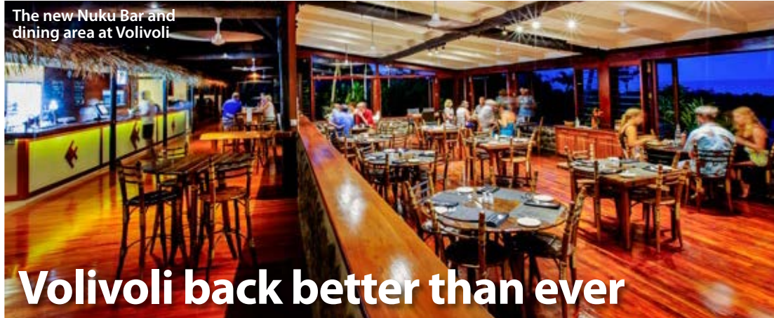
The new Nuku Bar and dining area at Volivoli.