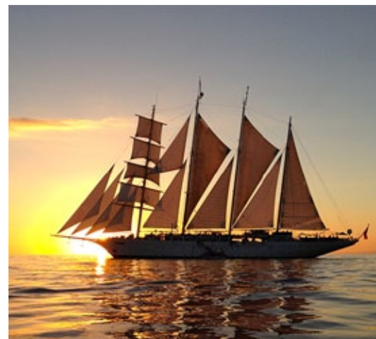
Star Clippers has a sharp agents' discount

Port charges and gratuities are additional and bookings will incur a $50 administration fee. Sale is available until further notice.