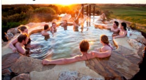
The Peninsula Hot Springs at Mornington Peninsula