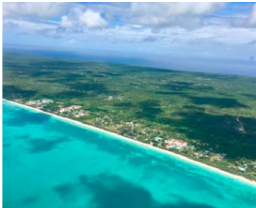
Ouvea: Twenty-five kilometres of beach, but hardly a footprint to be found