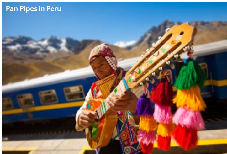
Pan Pipes in Peru