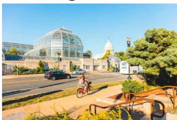
US Botanic Gardens, Washington, DC

Washington, DC is helping travellers plan a future trip to the USA from home, with a virtual vacation in the nation's capital.